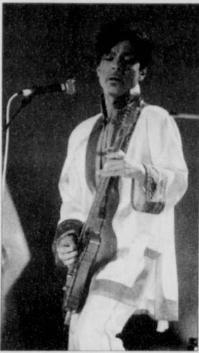
Prince performs Feb. 15 in London.