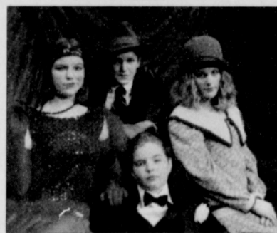
Bugsy Malone Jr.

Bugsy Malone Jr. -- A young mob of prohibition-era gangsters recreate the 1920 film classic at the Northwest Children's Theater. Performances are Saturday and Sunday matinees at 2 p.m. through April 18 at the NW Neighborhood Cultural Center, 1819 NW Everett St. Special Spring Break matinees March 28-31 at 2 p.m. For tickets call 503-222-4480 or visit www.nwcts.org .