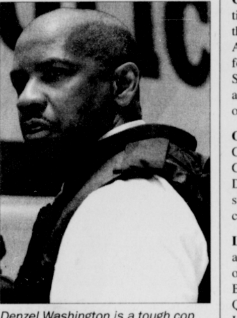
Denzel Washington is a tough cop in the suspense thriller 'Inside Man' opening Friday in area theaters.