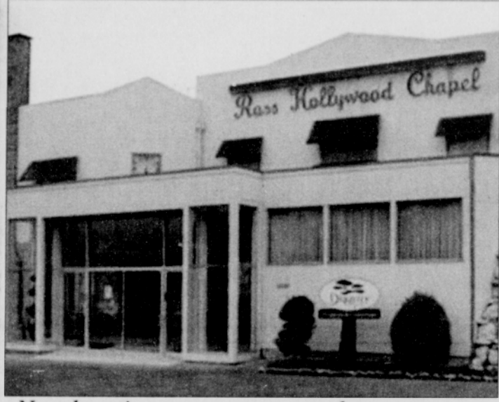
New location same great people, same great service and same attention to detail