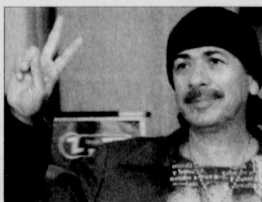
Carlos Santana calls for peace over war.

Carlos Santana quoted his old friend Jimi Hendrix in lashing out against President Bush in an anti-war message Monday. "There is more value in placing a flower in a rifle barrel than making war," Santana said. "As Jimi Hendrix used to say, musical notes have more importance than bullets."