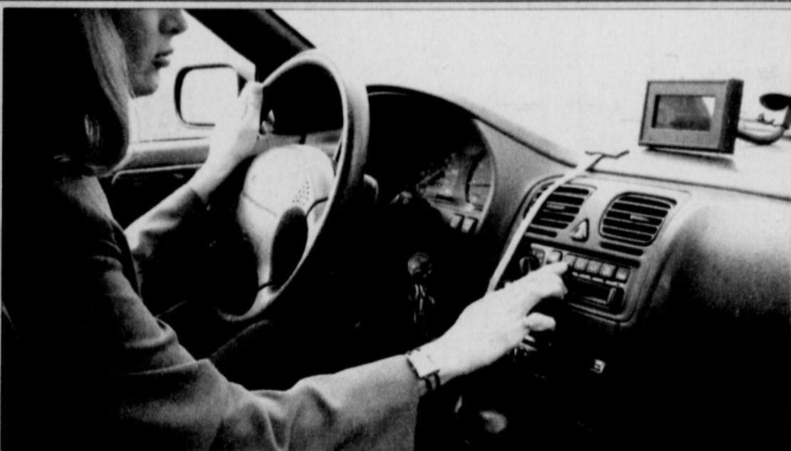
Electronic monitoring equipment would be installed the front dash and back end of vehicles participating in a mileage counting study by the Oregon Department of Transportation.