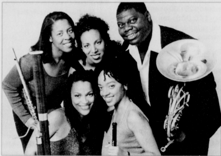
Imani Winds stays true to traditional chamber music while nodding to spicier African and American elements.

Exploring the links between European, African and American musical traditions is at the heart of their mission.