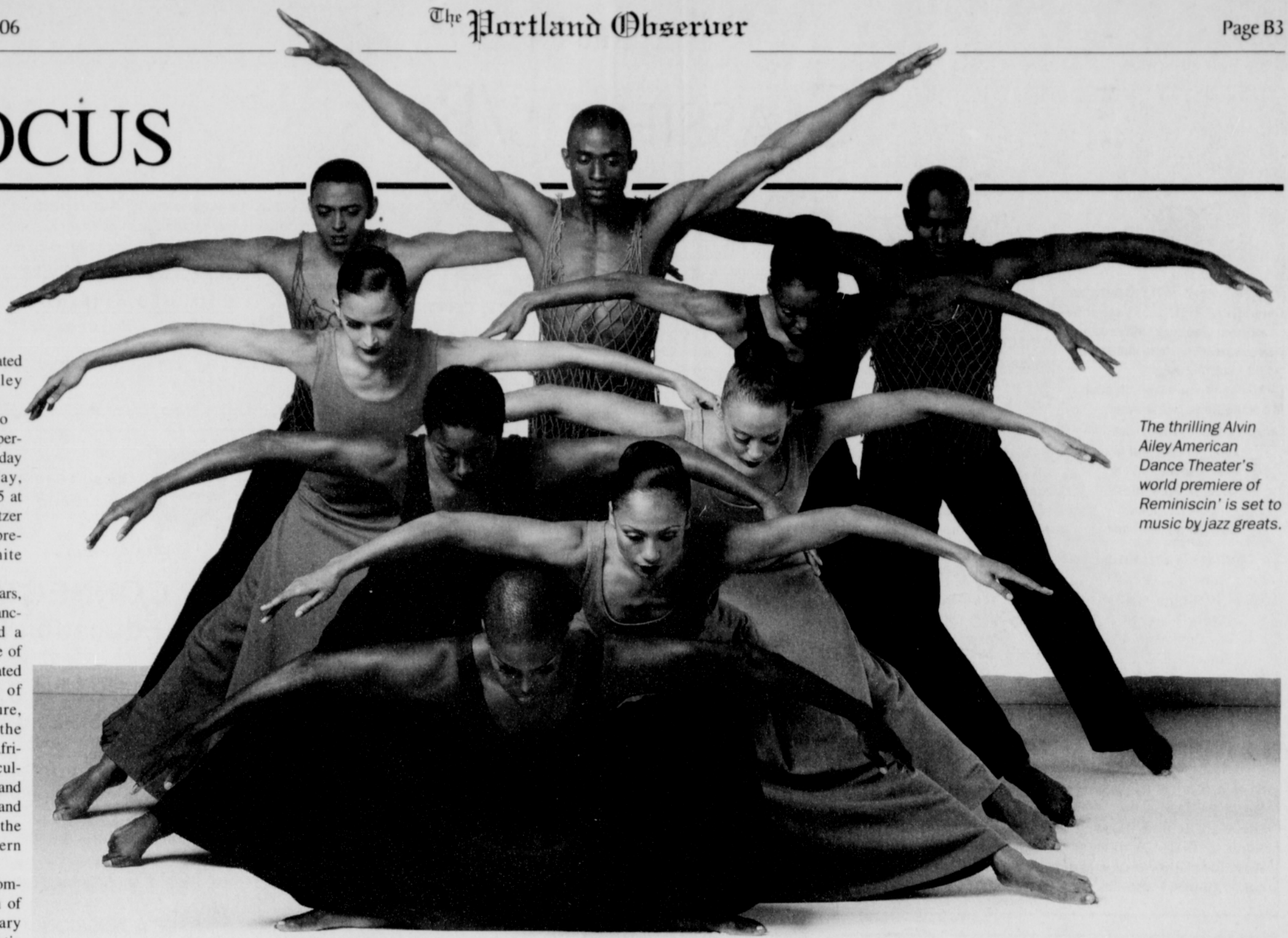
The thrilling Alvin Ailey American Dance Theater's world premiere of Reminiscent is set to music by jazz greats.

The second program is Vespers , a dramatic work for the Ailey women, full of raw energy and profound grace. Next on the program is Caught , a breathtaking fusion of art and tech-