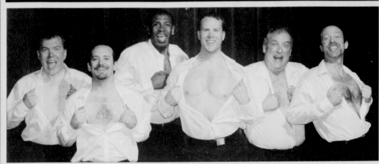
Actors are eager to take it off for "The Full Monty," a benefit for Profile Theatre Project.