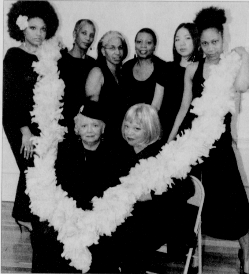
The Storytellerz Readers Theater (above) presents the Vagina Monologues, Saturday, Feb. 25 at Legacy Emanuel Hospital's Lorenzen Auditorium.