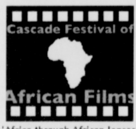
'Africa through African lenses'