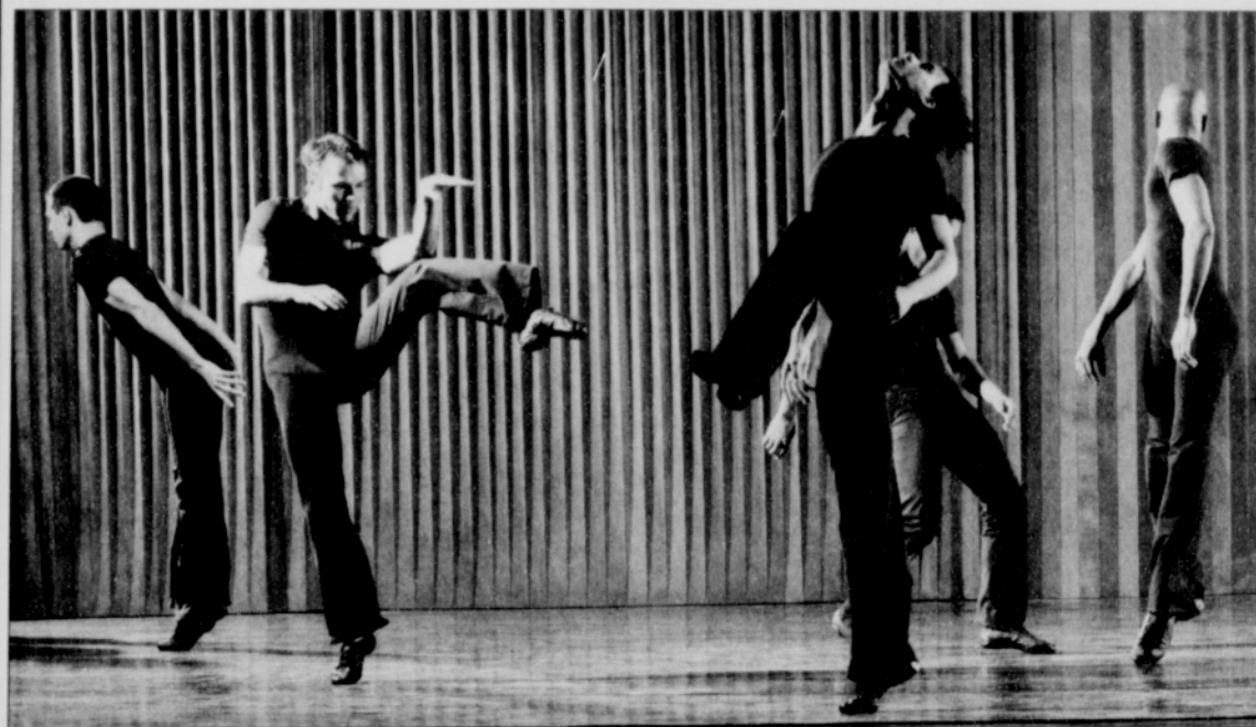
Grupo Corpo's Brazilian style emphasizes ensemble movement with a mesmerizing impact.