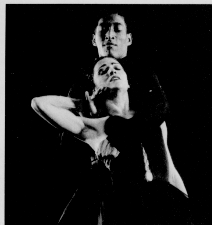
Lecuona, a sequence of 12 duets, is a timeless dance following storylines of romanticism and realism.

White Bird presents Grupo Corpo, Brazil's most popular contemporary dance company, Tuesday, Feb. 28 at 7:30 p.m. at the Arlene Schnitzer Concert Hall. The program will feature exhilarating music by Cuban Ernesto Lecuona and Brazilian Caetano Veloso.