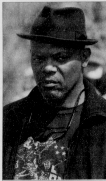
Samuel L. Jackson