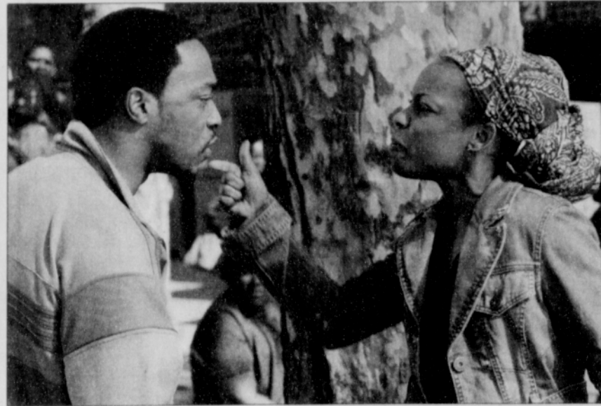
Anthony Makie and Aunjanue Ellis (above) star with Samuel L. Jackson in the suspense thriller 'Freedomland,' opening Friday in movie theaters.

Samuel L. Jackson stars in 'Freedomland' Oscar nominees Samuel L. Jackson and Julianne Moore give riveting performances in the sus-