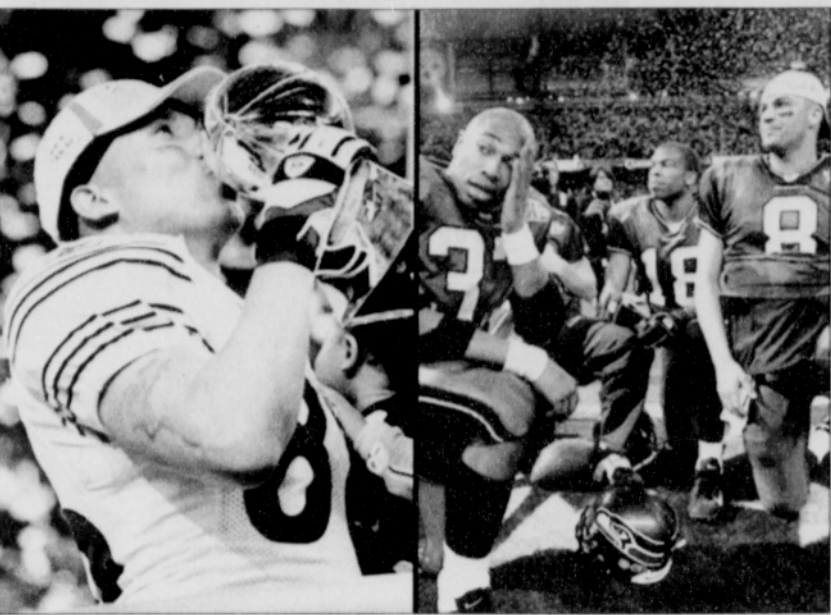
Super Bowl MVP Hines Ward (left) celebrates his Pittsburgh Steelers victory while Seattle Seahawks players find disappointment at the end of their first ever championship game.

It was sweet validation for Cowher with a title in his 14th season as their coach, the longest tenure in the NFL. The tough guy, who lost his only previous Super Bowl 10 years ago to Dallas, teared up as he walked to midfield to embrace Seahawks coach Mike Holmgren. "A lot of people tell you you can't do it, but you know what, it