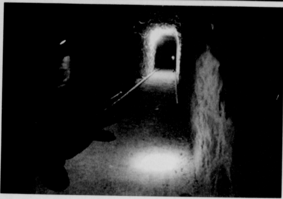
A Mexican police officer shines his flashlight in a tunnel used to smuggle drugs across the Mexico-U.S. border.