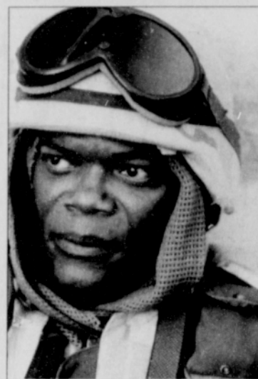
Samuel L. Jackson