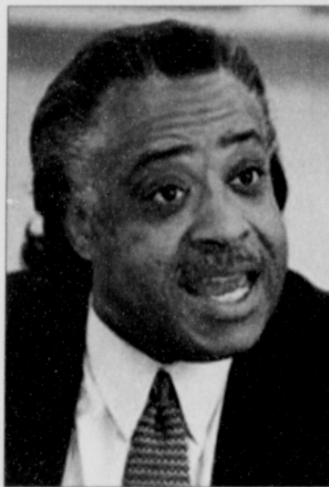
Rev. Al Sharpton

The episode, "The Return of the King," aired Jan. 15, the day before the national holiday honoring the slain civil-rights leader. It shows King emerging from a coma and using the n-word in an angry speech venting his frustration toward sexually explicit hip-