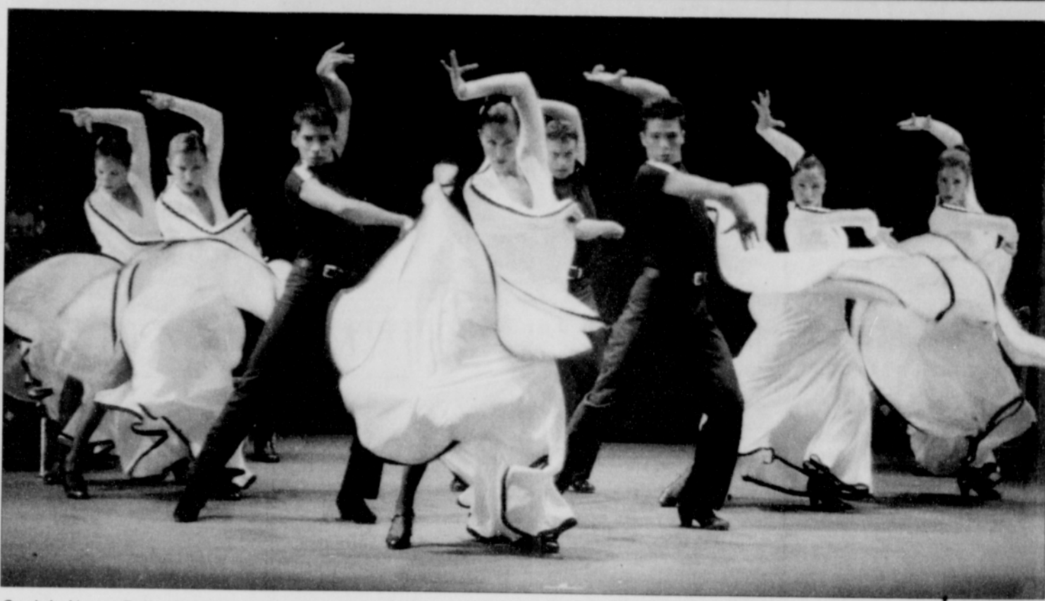
Spain's Nuevo Ballet Espanol displays both a unique flare of flamenco dance and traditional movement.