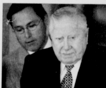
Former Chilean dictator Augusto Pinochet (right).

(AP)—Former Chilean dictator Augusto Pinochet has been stripped of immunity from prosecution in 59 cases of torture and kidnapping at a secret detention center where hundreds of dissidents were held — including President-elect Michelle Bachelet and her