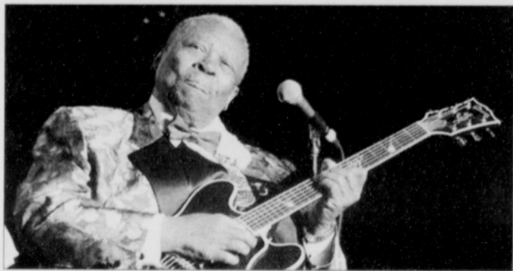
Blues guitarist B.B. King performs Jan. 5 in Lowell, Mass.

"I hardly remember I'm 80 unless I have to run up a hill or stairs," the singer and guitarist said. "As long as people buy my records and come to my concerts, I don't see anything else I'd like