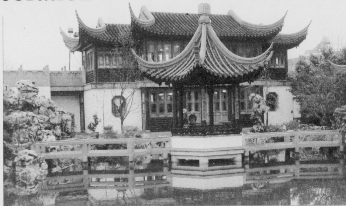
The tranquil Portland Classical Chinese Garden is a source of inspiration, intellect and spirituality.

Built by Chinese artisans, the garden reflects back from the waters that surround different teahouses and flow with dazzling