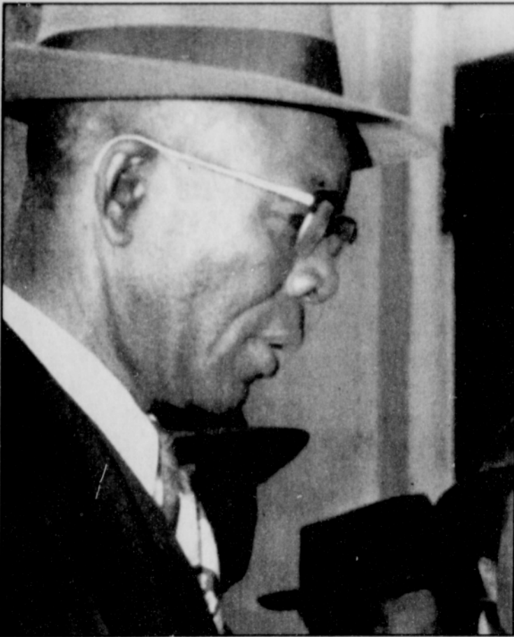
E.D. Nixon, legal redress chairman of the Montgomery branch of the NAACP