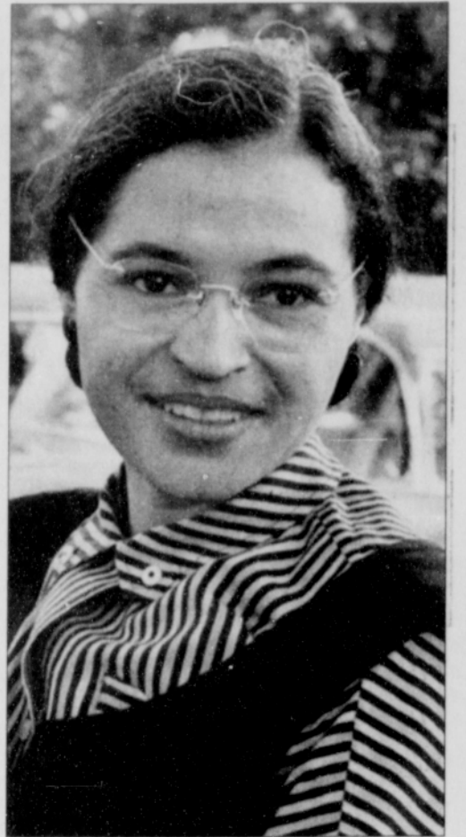
Rosa Parks in 1955