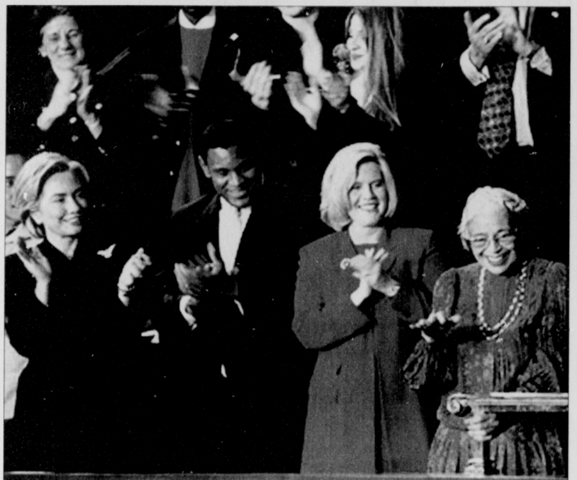
Rosa Parks (right) during President Clinton's State of the Union address.