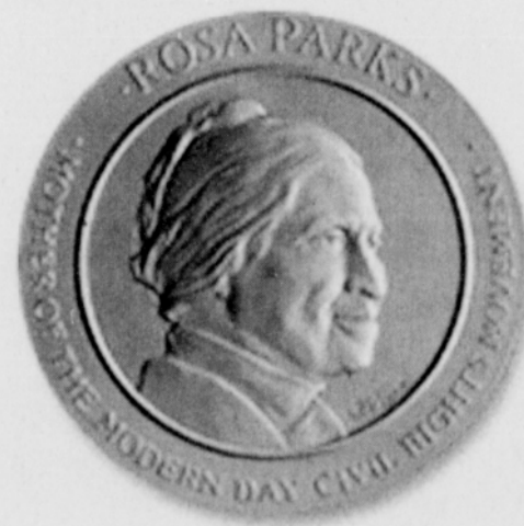
The Congressional Gold Medal of Honor given to Rosa Parks by President Clinton.

• Oct. 24, 2005: Parks dies quietly in her apartment in Detroit only days before the 50 th Anniversary of the Montgomery bus boycotts.