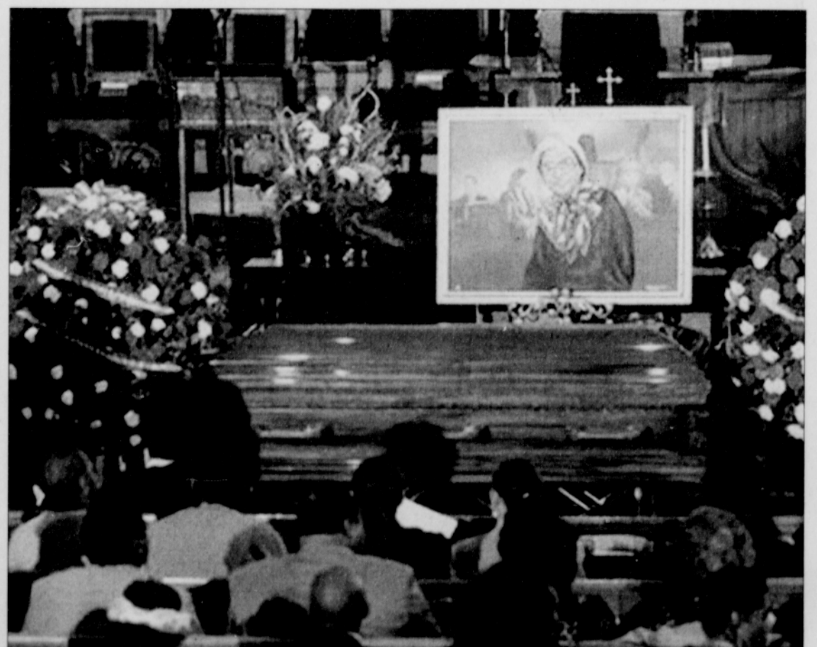
Rosa Parks funeral was a widely attended event, celebrating her life and legacy.

Legislative Administration 900 Court St. NE, Room 140A Salem Oregon, 97301 Phone: 503-986-1848 Web Site: http://www.leg.state.or.us