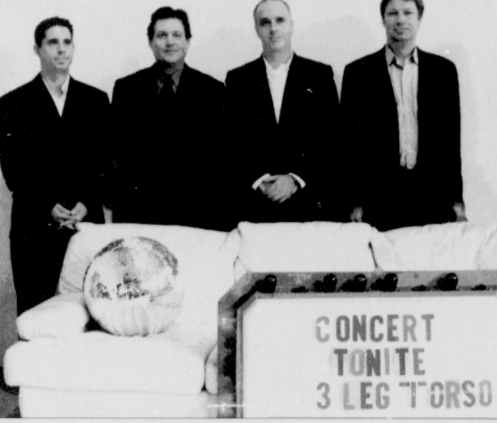
The chamber music quintet 3 Leg Torso performs Friday at Mississippi Studios in north Portland.