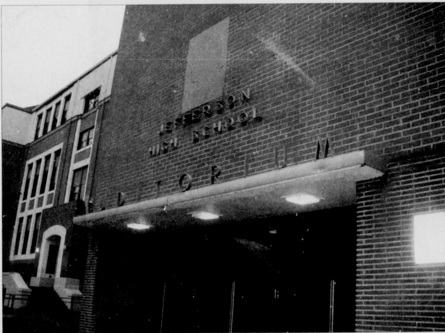
Portland's annual tribute to Rev. Dr. Martin Luther King Jr. returns to the Jefferson High School and a newly dedicated stage at the Robert Grady Ford Auditorium on Monday, Jan. 16.