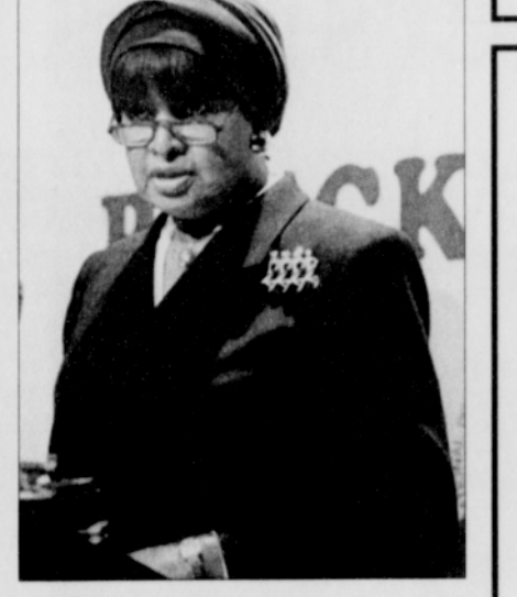
C. DeLores Tucker, 78. Longtime civil rights activist. Oct. 12.