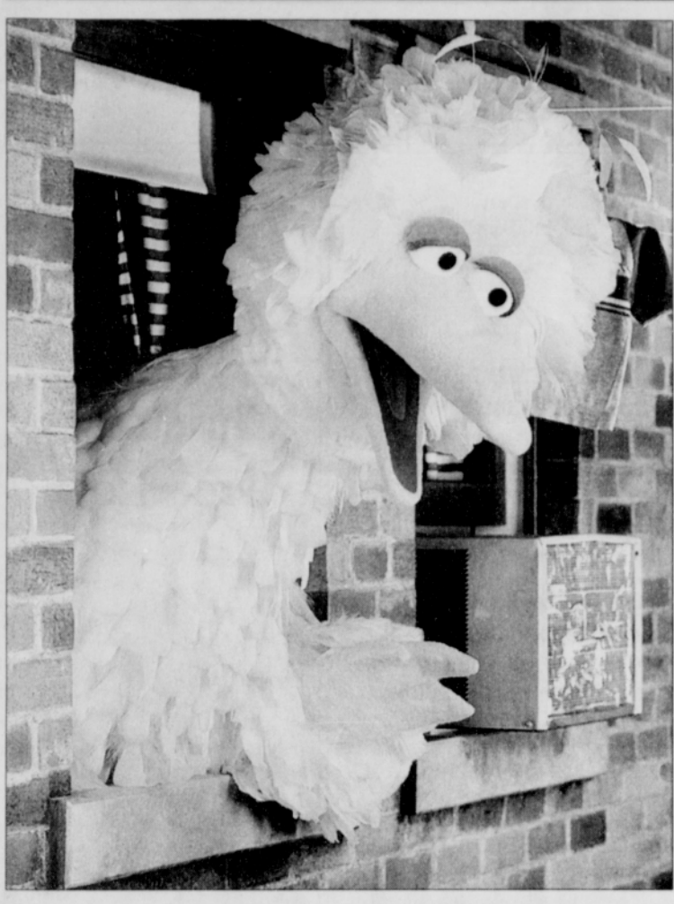
A national touring exhibit featuring Big Bird and the other favorite characters from Sesame Street is coming to the Portland Children's Museum.