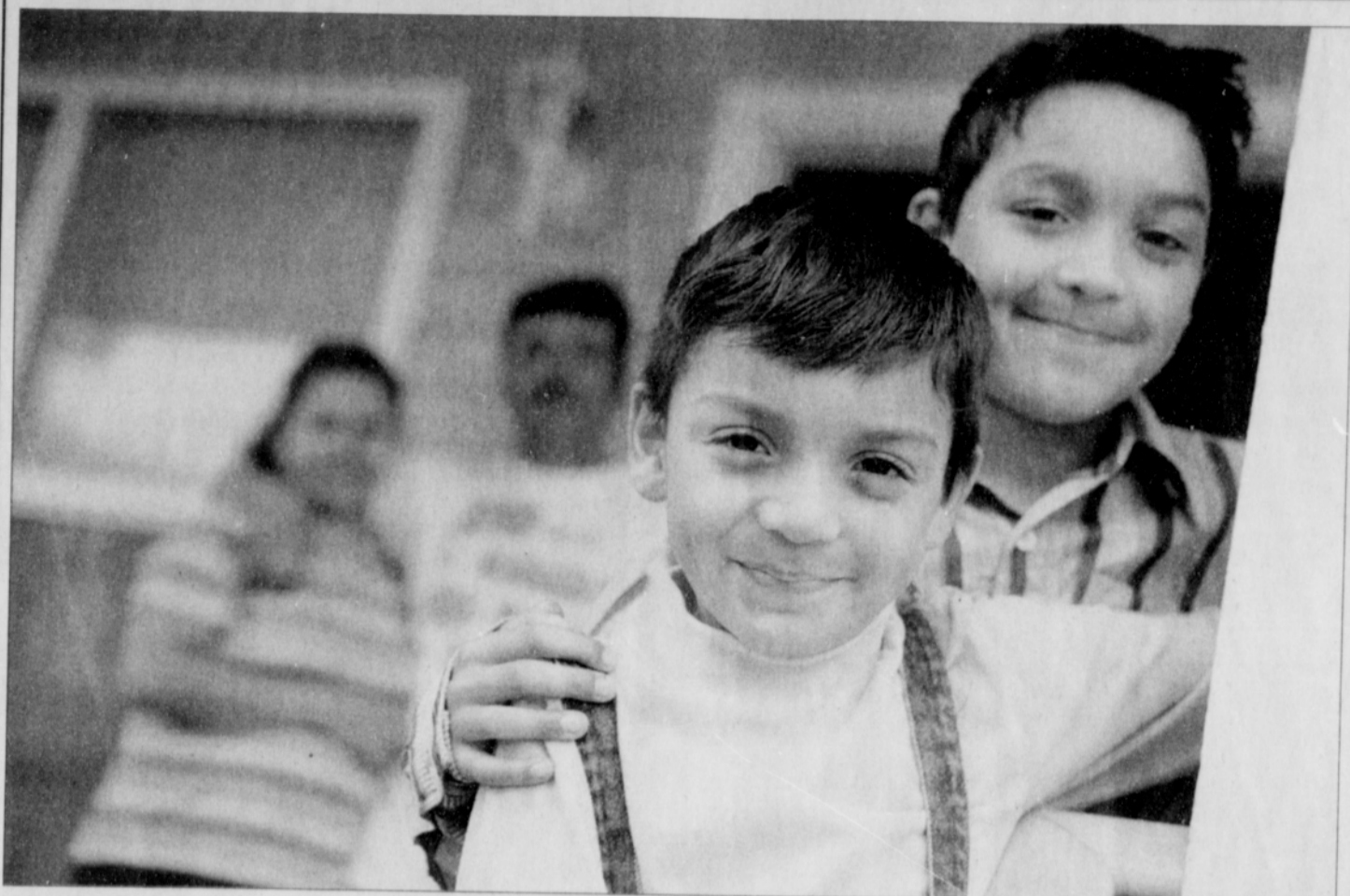
'Martinez Boys,' courtesy of Eckleman Photography, is one of the photographs going on the auction block for Habitat for Humanity and Architecture for Humanity.