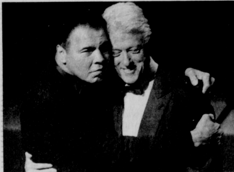
Muhammad Ali hugs former President Bill Clinton as he walks onstage at the grand opening gala celebration for the Muhammad Ali Center, Saturday in Louisville, Ky.

(AP) — Muhammad Ali can still draw a big crowd. The boxing great took center stage in his hometown Saturday night to celebrate the opening of the Muhammad Ali Center, a six-story tribute to Ali's storied career and a legacy to his ideals of peace and tolerance.