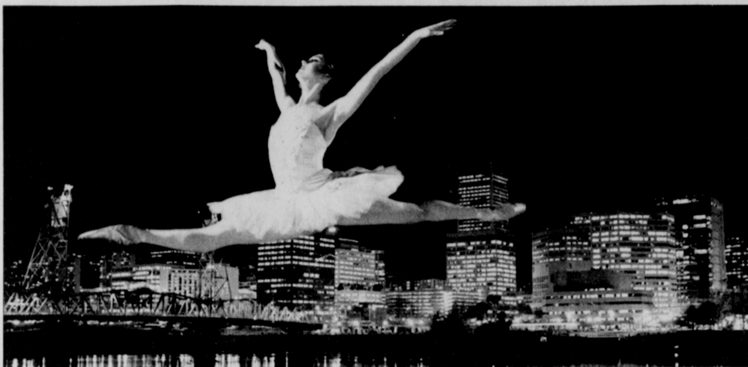
The Oregon Ballet Theatre presents holiday performances of 'The Nutcracker.'