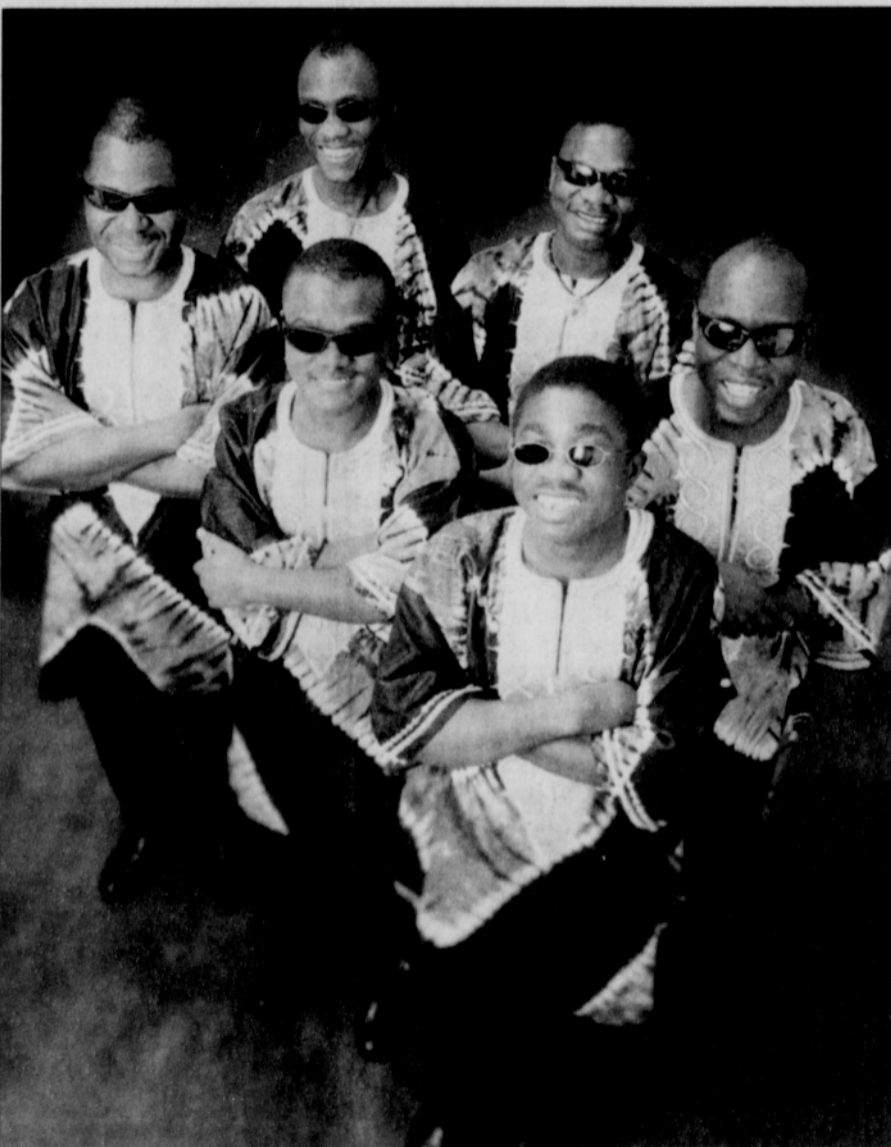
African Gospel Acappella is comprised of six blind musicians who sing in several languages. The Vancouver musicians, originally from Liberia, will perform at the Africa Aids Response 4th annual benefit concert and dance.

students and students and are available at all Safeway Ticketwest outlets or by calling 503-224-8499 or visiting www.ticketwest.com.