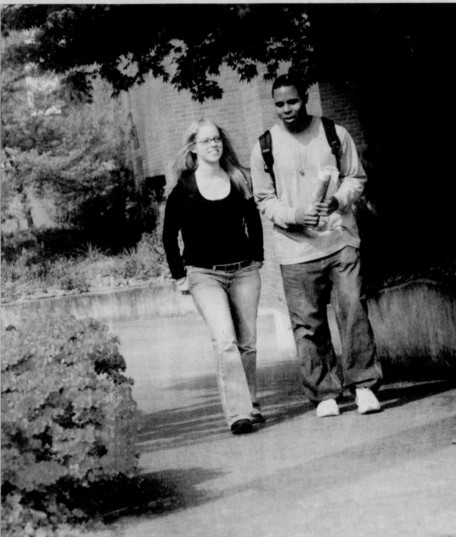
Students at Concordia University in northeast Portland have more options with a dual enrollment agreement with Portland Community College and two other community colleges in the state.

For more information on the dual enrollment program, contact Concordia University's Department of Admission at 503.280.8501 or visit www.concordia.edu/admissions/