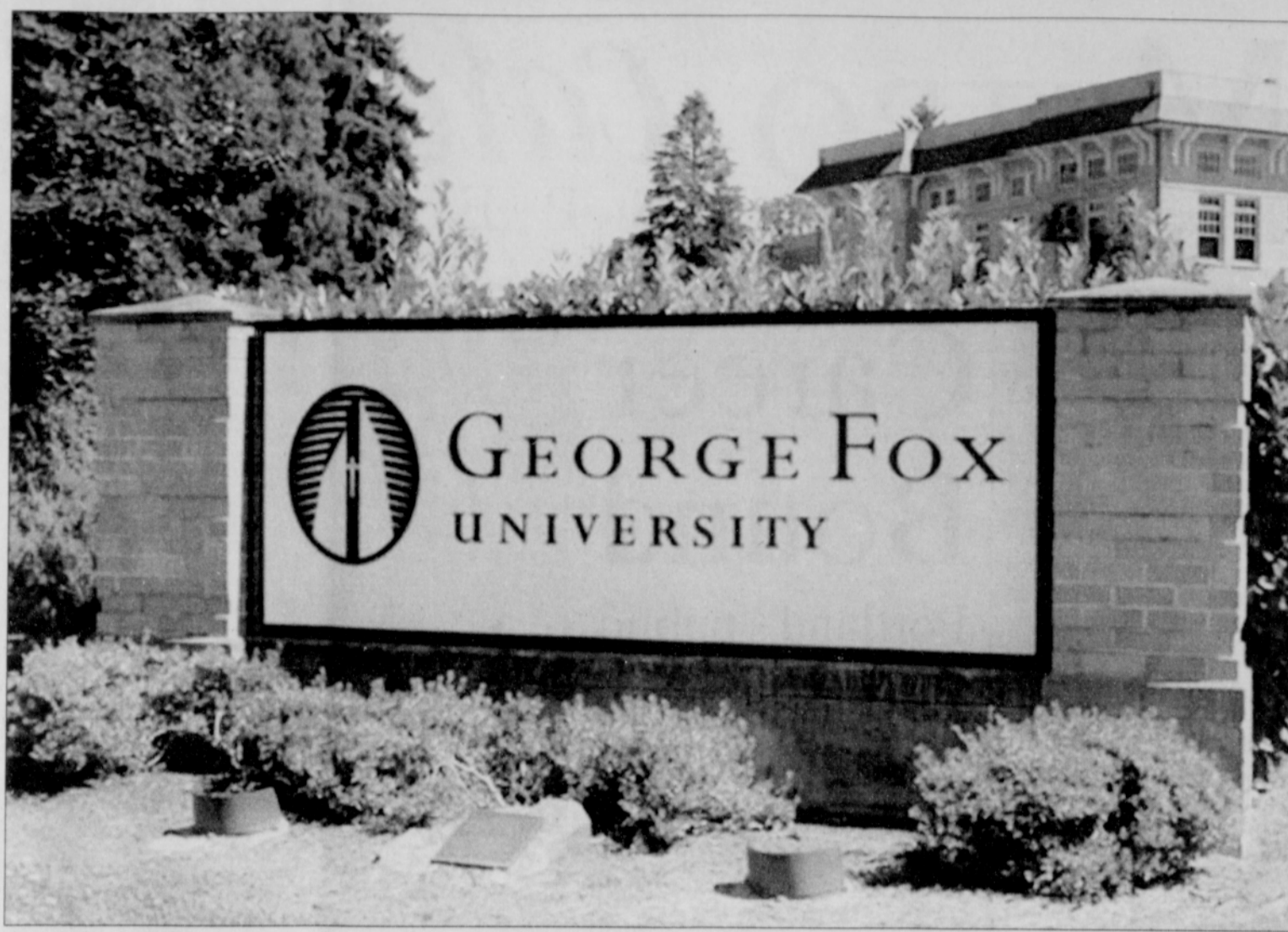
The entrance to the George Fox University campus in Newberg. The college also offers classes in Portland and other sites.