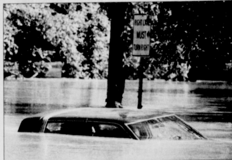
A car flooded to its rooftop is an example of the hundreds of thousands of automobiles ruined by flooding from hurricanes Katrina and Rita along the Gulf Coast.

Inspect the vehicle. Look for signs of water, mud, corrosion or residue in carpet, upholstery, the glove box, inside the dash if that's easy to examine, inside tail light fixtures, etc.