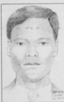
Police released this sketch of a suspect in a sexual assault.

The suspect is described as about 21 to 25 years old and possibly East Indian, African American or another national-