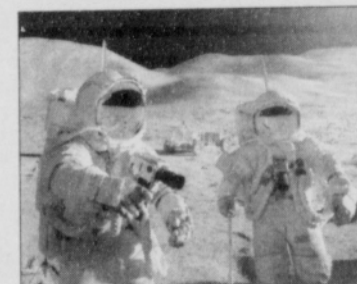
Walking on the Moon

Moonwalking at OMSI -- The Oregon Museum of Science and Industry is currently featuring the larger than life documentary "Magnificent Desolation: Walking on the Moon." Through the eyes of 12 astronauts, viewers have the chance to experience a virtual trip to the moon via NASA footage and live action renditions. For more information on tickets and show times, call 503-797-4640 or visit www.oms.edu/visit/omnimax .