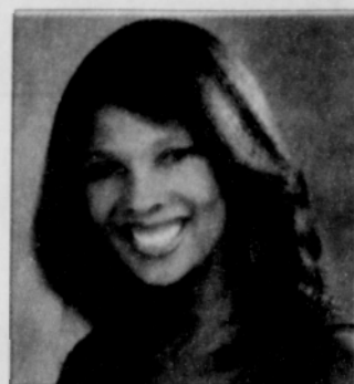
See Metro section, inside