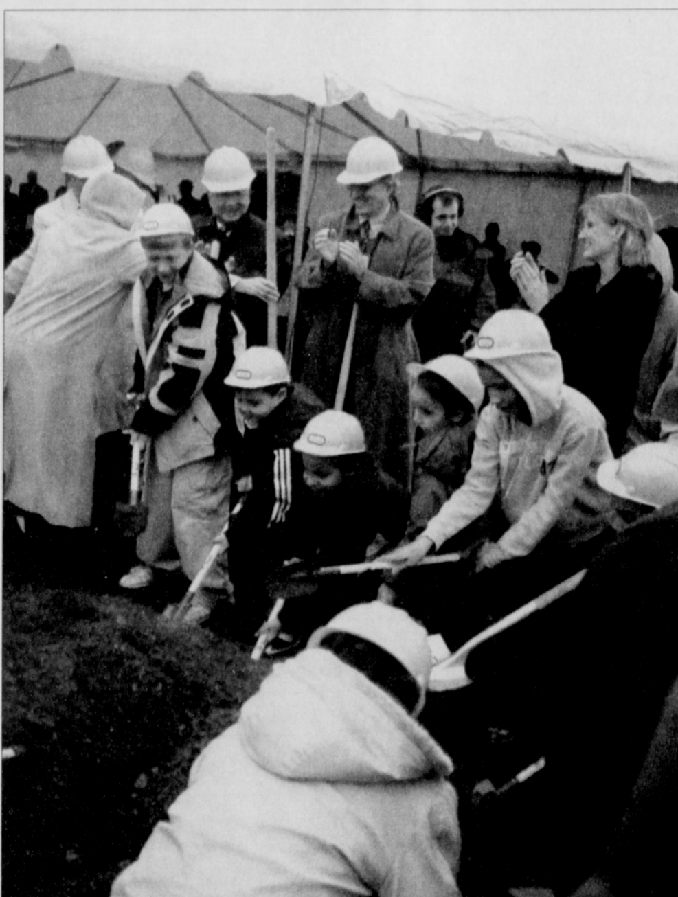
Students from north Portland's Ball Elementary join city, school and housing officials Monday in a groundbreaking ceremony to begin construction of a brand new Ball School for New Columbia, the new neighborhood in the Portsmouth community.