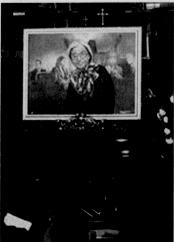
An overflow crowd is seated behind the casket of civil rights pioneer Rosa Parks at the Metropolitan African Methodist Episcopal Church in Washington.

People of all ages will join together to honor this remarkable woman in an evening of tributes and celebration.