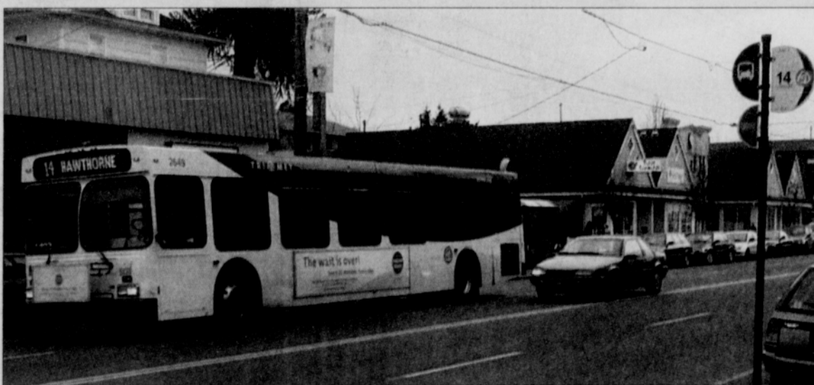
High diesel prices have triggered another fare increase to ride the bus.

ducing idling time, adjusting transmissions, front-end alignments and steering control arms, and maintaining a set tire pressure. The steps have allowed the agency to decrease the amount of diesel purchased annually, from 7 million gal-