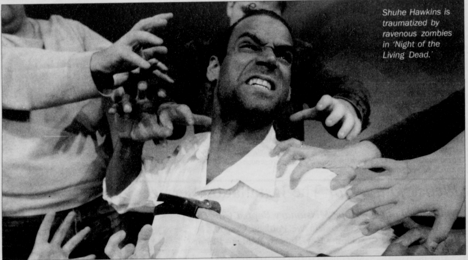
Shuhe Hawkins is traumatized by ravenous zombies in 'Night of the Living Dead.'

For more information or to reserve seats, call 503-222-4480 or visit www.nwcts.org .