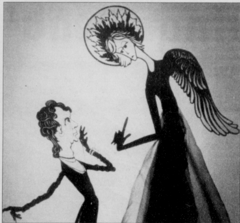
The old woman and an angel from the Tears of Joy Theatre production of Onion Skin Soup .