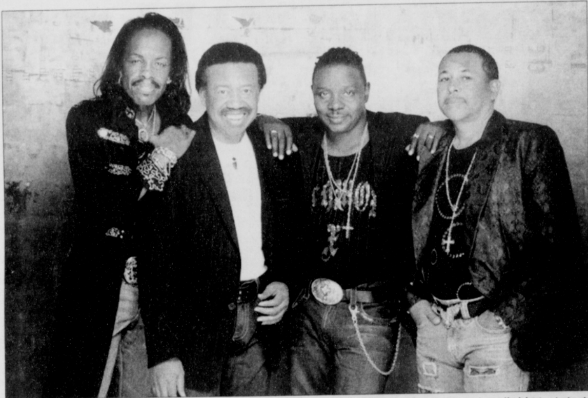
The legendary band Earth, Wind & Fire, has a new album featuring some of hip hop and soul's biggest stars