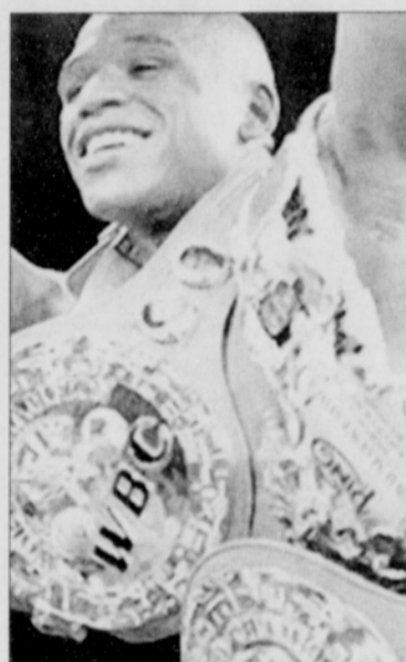
Floyd Mayweather Jr.

If the match comes true, the fight would be the biggest for Portland since boxer Roy Jones came to town three years ago. KGW said an undercard for the Nov. 19 event would feature Andre Ward, who won a Gold medal at the 2004 Olympics.