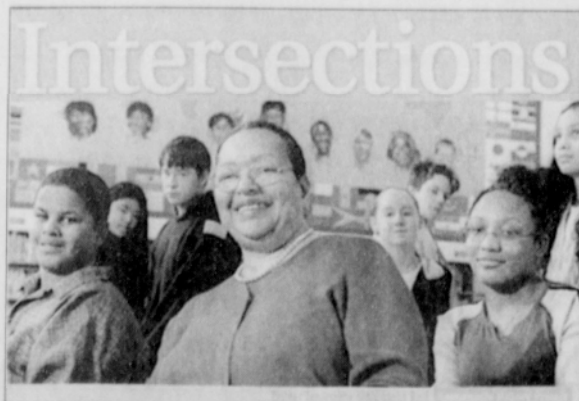
'Intersections' is about the people living in the communities near the Interstate Max Yellow Line.