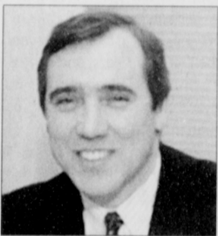
Rep. Jeff Merkley