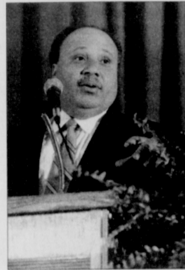
Martin Luther King III

Utilizing the principles of Kingian nonviolence, Martin King quietly