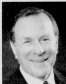
Gov. Ted Kulongoski

"Small businesses are the backbone of Oregon — they inspire innovation and create economic opportunities for our citizens and our communities," Kulongoski said. "The state