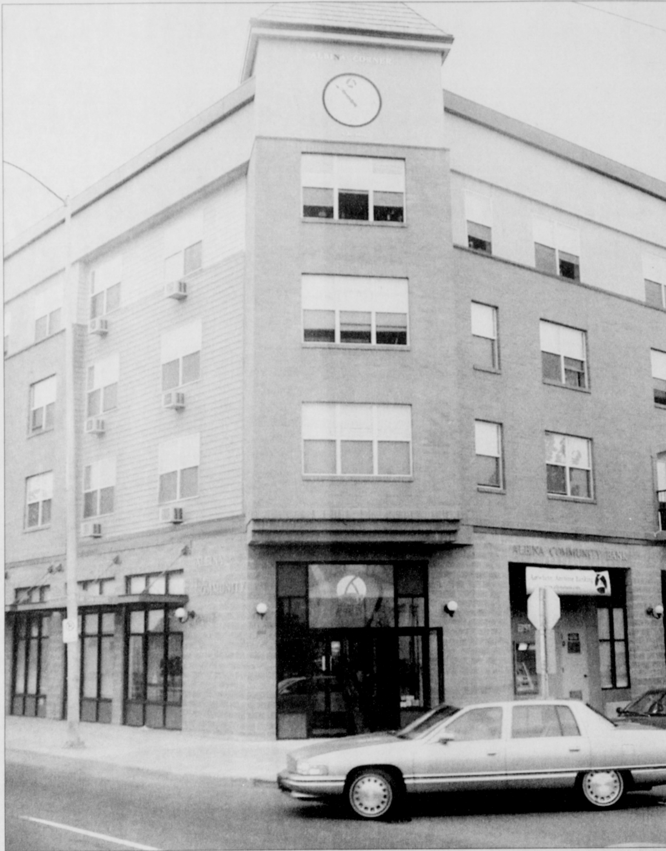
Albina Community Bank is a minority-owned financial institution headquartered on Northeast Martin Luther King Jr. Boulevard.

"Because we're a bank, by regulation we cannot be a nonprofit; we have