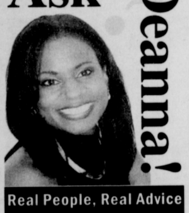
An advice column known for its fearless approach to reality based subjects!