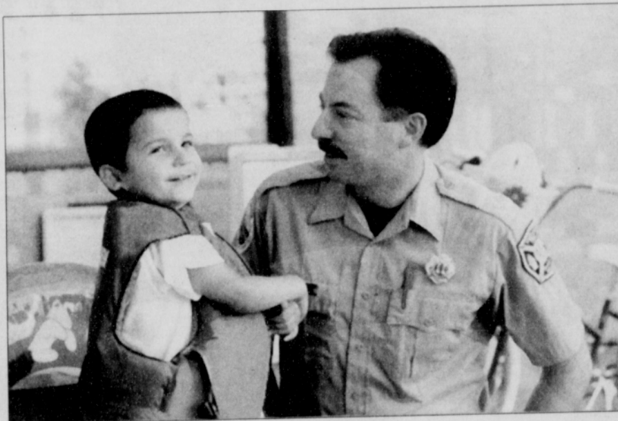
Local kids will get safety tips directly from emergency medical providers and other safety officials at this weekend's Safety Safari at OMSI.