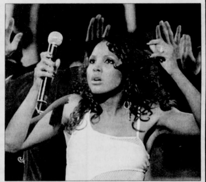
Toni Braxton performs at the 10th Annual Soul Train Lady of Soul Awards in Pasadena, Calif.

The big winners of the Sept. 6 event to be broadcast later this month were Mariah Carey, Destiny's Child, Alicia Keys and Missy Elliott.