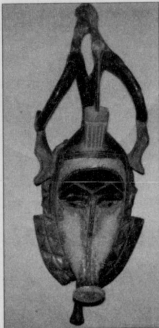
A funeral mask made of wood and horn from the Gouru tribe on the Ivory Coast.