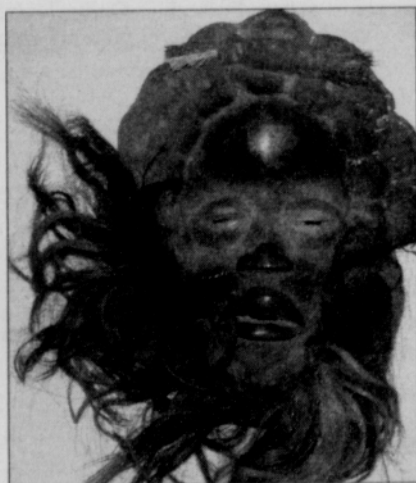
A trial mask made of wood, cloth, feathers and hair from Makonde Tanzania/Mozambique.