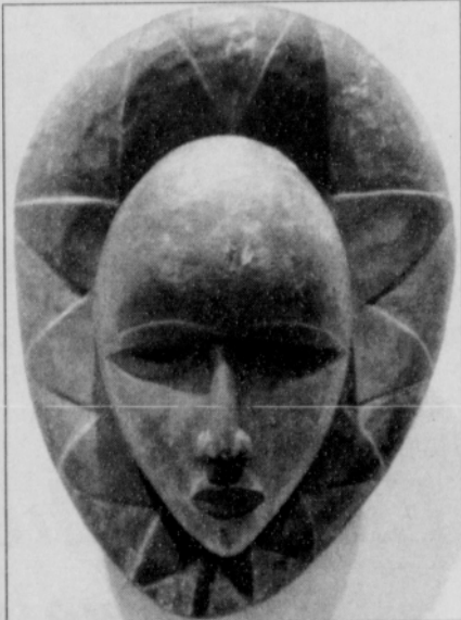
A female mask made of wood from the Fang tribe in Cameroon.