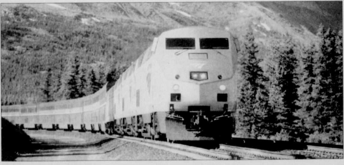
The Amtrak 'Empire Builder' transcends a mountain pass.

20 years with an addiction to heroin. cated just blocks away from the He quit the drug cold turkey in 1965. recording studio and business office where Charles produced "Georbum, the Grammy-winning "Genius