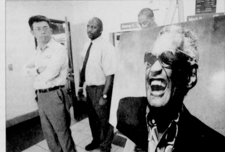
A photo of Ray Charles is displayed inside the Ray Charles Post Office during an official naming ceremony in Los Angeles.

lost his eyesight at 7, was an orphan at 15 and struggled for nearly