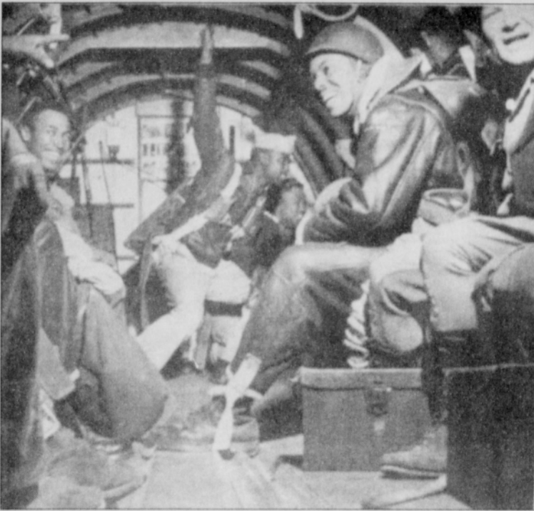
Members of the 555th Parachute Infantry Battalion, the first and only African American paratroop battalion in American history, peer through the open door of the Troop Carrier Command C-47 over Southern Oregon.