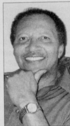
Walter Dean Myers

For more than 30 years, Myers has been writing for and about teens. His realistic, street-wise novels for young adults explore their values and decisions. He has based his novels on years of research from visiting school classrooms, youth detention centers, and prisons.