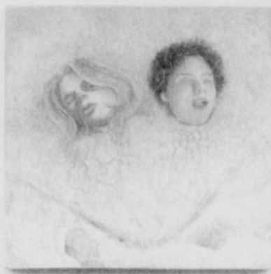
"Erotic dreams under the earthy sheets."

She describes her art as "portraits of reality converted into fantastic