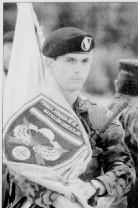
A Salvadoran Army soldier marches to board a plane at a military base.

Saca said the troops' humanitarian mission would include "build-