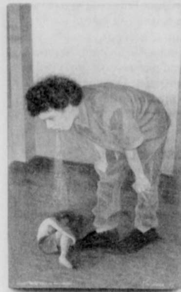
"Eating so much hatred makes us sick."

Hoz chooses egg tempura as her medium because the painting technique produces intense color and durability. While oil paintings often begin to crack and yellow within a few years, a properly executed egg tempura painted can be expected to last for centuries without cracking or changing in color. In portraying the complexities of our troubled