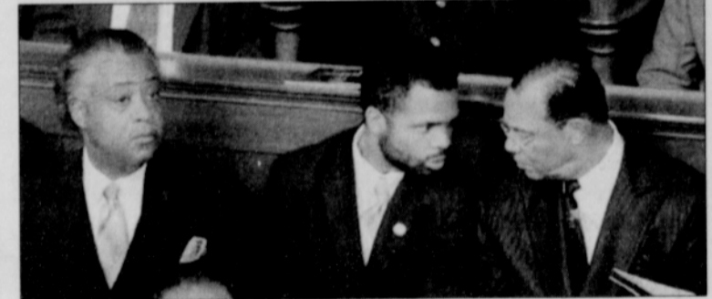
Rev. Al Sharpton (from left), U.S. Rep. Jesse Jackson Jr., and Nation of Islam leader Louis Farrakhan at Monday's funeral of Ebony and Jet magazine publisher John H. Johnson.

"Why are you so foolishly sensitive when somebody is telling you the truth?" he asked the crowd at Mercy Memorial Baptist Church. He said blacks and Latinos should form an alliance to correct differences and animosity between the two communities.