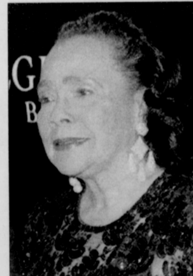
Coretta Scott King

the King family at the Georgia State Capitol on June 30, her son Martin Luther King III said his mother was "doing well" and was only abiding by her doctor's orders to limit her activities. He refused to give additional details.