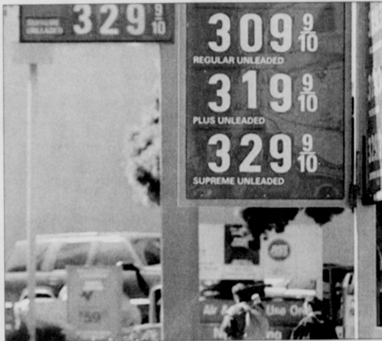
Gas prices above $3 a gallon are found in San Francisco. For the West, the average price of unleaded hit $2.62 a gallon.

(AP) — The pinch at the pump is starting to feel more like a punch for a growing number of Americans.