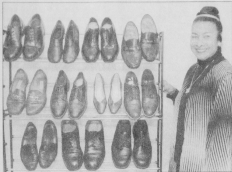
Walk of Fame Founder Xernona Clayton stands with shoes of 11 honorees that have helped the civil rights movement.