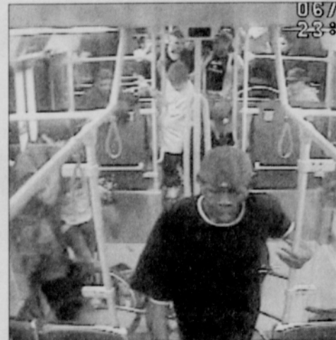
One of 12 people suspected in the assault of a Max passenger with a bicycle is shown in this surveillance video released by the Portland Police Bureau.

Crime Stoppers is offering a cash reward of up to $1,000 for information that leads to an arrest in this case, or any unsolved felony. All calls may remain anonymous at 503-823-4357.